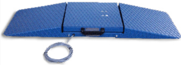
TPS platform with 2 TPSR ramps (optional)