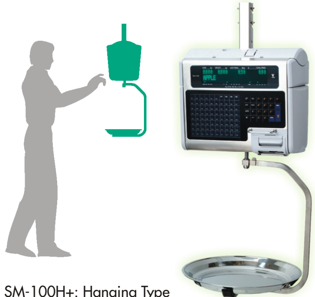
SM-100H+: Hanging Type 76 Preset Keys