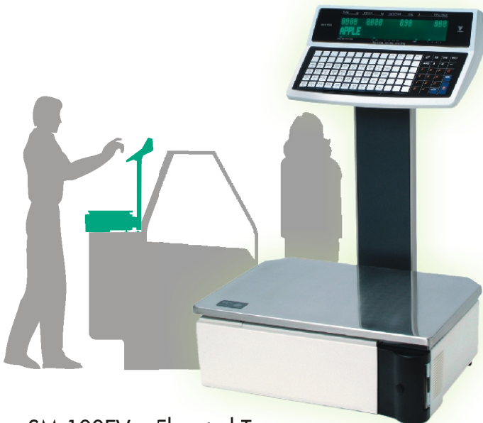
SM-100EV+: Elevated Type 74 Preset Keys