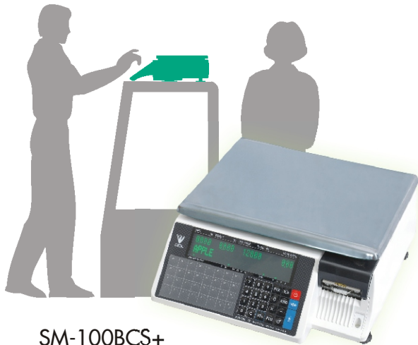
SM-100BCS+ 32 Preset Keys

This Series provides the best value for your store's operation.