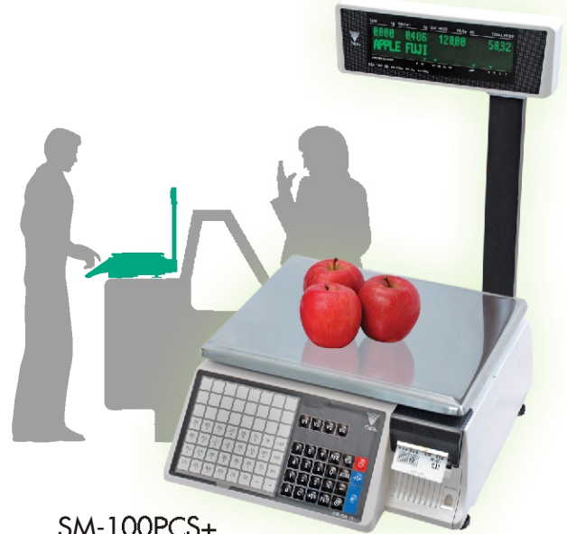
SM-100PCS+ 56 Preset Keys