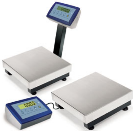
EPQ30 with or without TQNC column