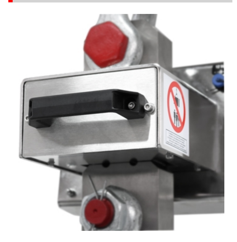
Crane scale MCW09: extractable battery view