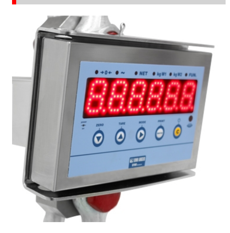
Crane scale MCW09: extra-bright 40mm display