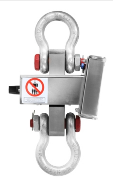
Crane scale MCW09: side view